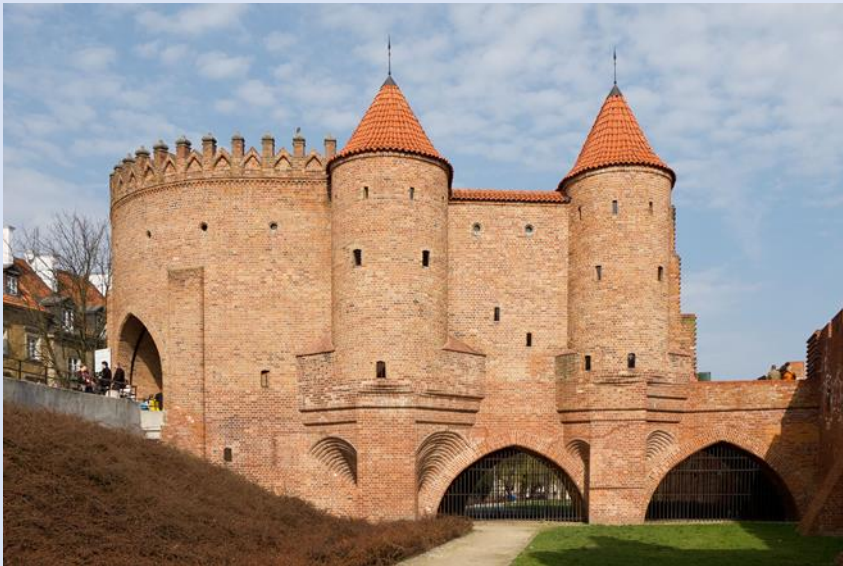
Warsaw Barbican, Warsaw, Poland