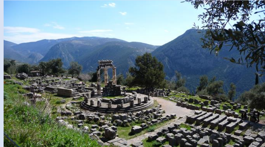
Tholos of Delphi, Delphi, Greece