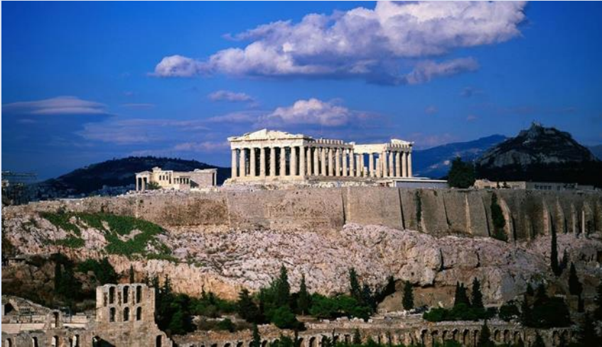
Acropolis of Athens, Athens, Greece