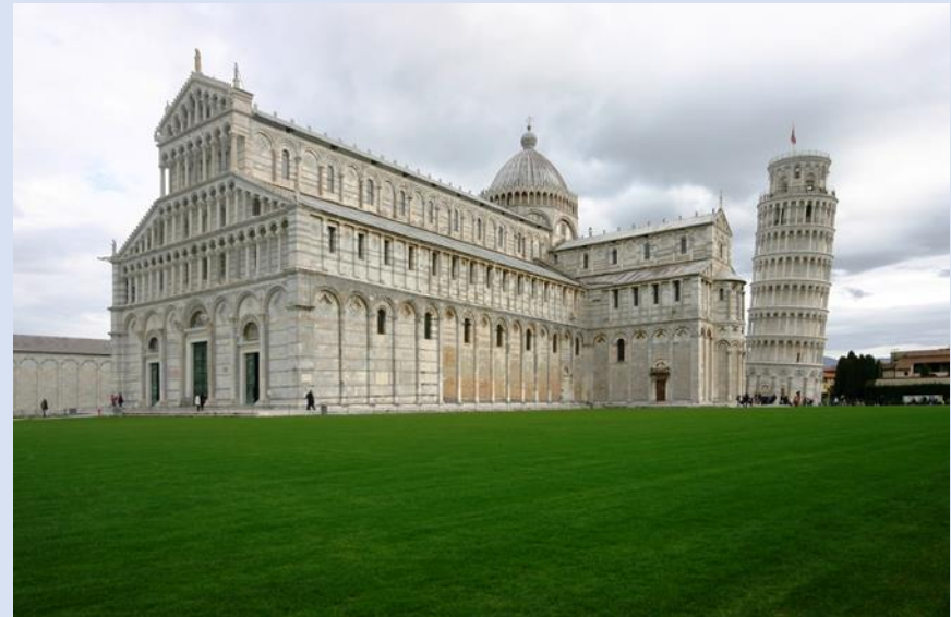
Pisa Tower, Pisa, Italy